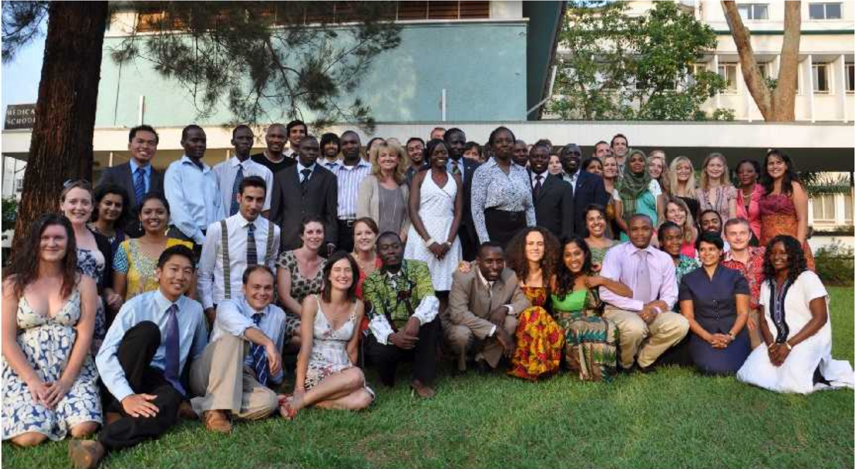
EADTMH CLASS OF 2014